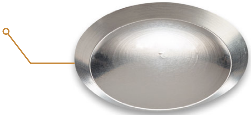
Aluminium-Magnésium alloy dome

In short, the moving part is always under control and has maximum acceleration capacity, key to reproducing subtle sound details. The frequency response curve is also extremely linear by way of the upstream work performed on all the components (dome, surround, coil). Thus, the filtering carried out downstream will be decidedly minimal, favouring a dynamic and highly accurate reproduction of the original audio signal. Developing the transducer in this way provides an extended frequency response of 23 kHz.