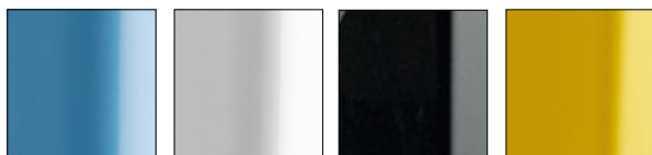
Gauloise Blue Carrara White Black Lacquer Solar Yellow