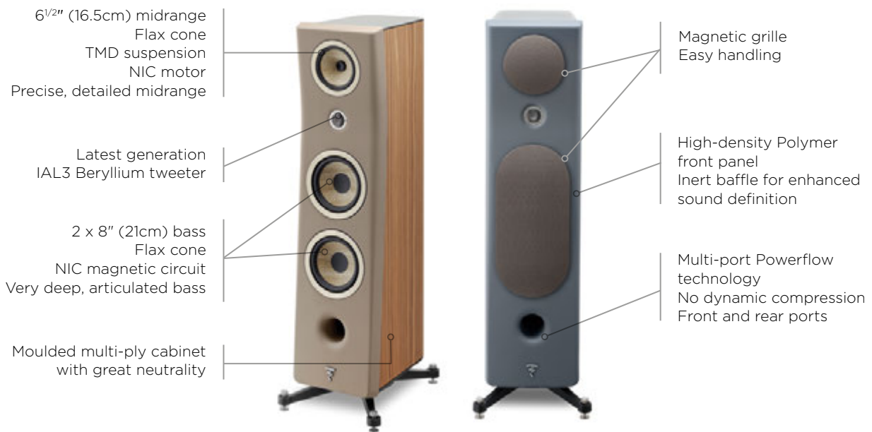
Kanta N°3, Wood Veneer cabinet, Warm Taupe and Dark Grey front panels

Kanta N°3 is the reference product for the line. This 3-way speaker combines depth, impact and articulation in the bass. The heightened midrange definition and neutrality are the result of Flax technology innovations, TMD suspension and NIC. The latest generation IAL tweeter provides the ability to reproduce the tiniest details with clinical precision. With a resolutely modern, ingenious design, this sound equipment will be at its best in a room from 430 to 860ft 2 (40 to 80m 2 ).