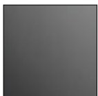
Black High Gloss