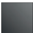
Black High Gloss