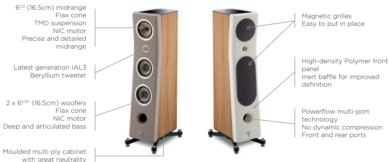
Kanta N°2, Walnut cabinet, Matt Warm Taupe and Ivory front panels

Kanta N°2 is a three-way floor standing loudspeaker totally dedicated to performance. Kanta N°2 is equipped with a new generation IAL tweeter featuring a Beryllium inverted dome and Flax sandwich cone speaker drivers. This is an unprecedented combination of technologies to guarantee precise, detailed and warm sound. Focal's latest acoustic innovations have been integrated into these floorstanders encompassing a modern and distinctive design. These loudspeakers are perfect for rooms measuring up to 320ft 2 (30m 2 ) and they're also ideal for larger rooms of up to 750ft 2 (60m 2 ).