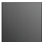
Black High Gloss