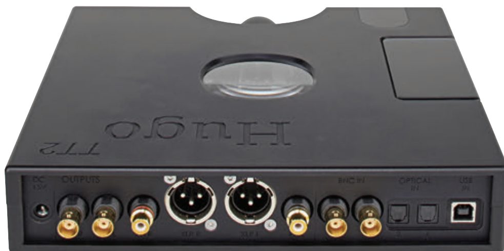
At left, twin BNC output sockets (for future products). Next along, two large XLR socket outputs flanked by phono-socket outputs. Then come twin BNC digital inputs that together form a DBNC input. At right are TOSLINK optical inputs and a USB B computer connection.

Modern hi-res recordings such as Marta Gomez singing 'Maria' (24/96) bettered CD in obvious fashion by fleshing out a performance with more intense inner detail – making CD sound a tad barren by way of contrast. With this superb recording,